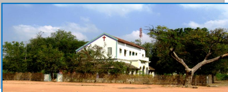
THE HOUSE I STAYED